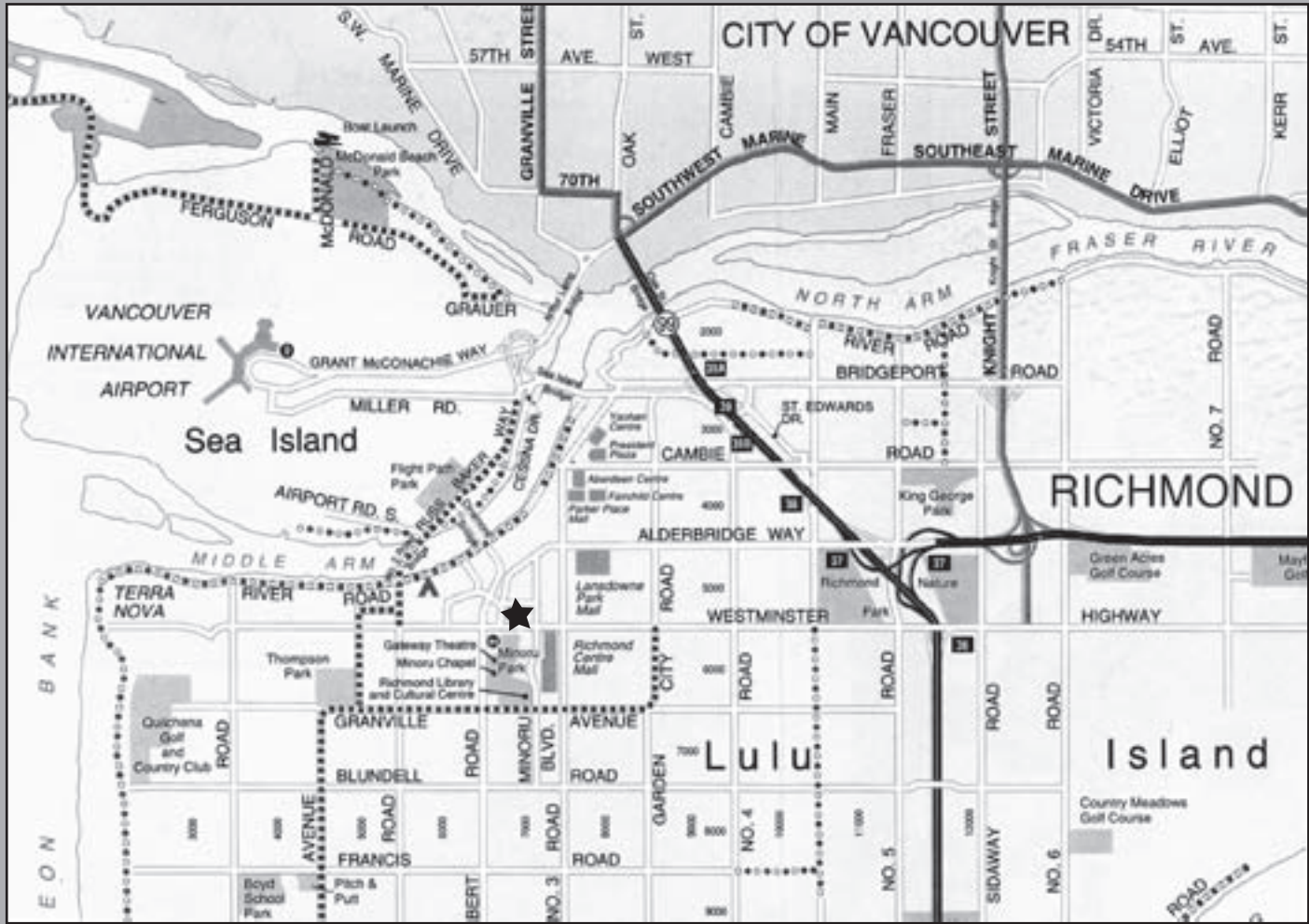
★ Best Western Richmond Hotel and Convention Centre 7551 Westminister Highway Richmond, BC